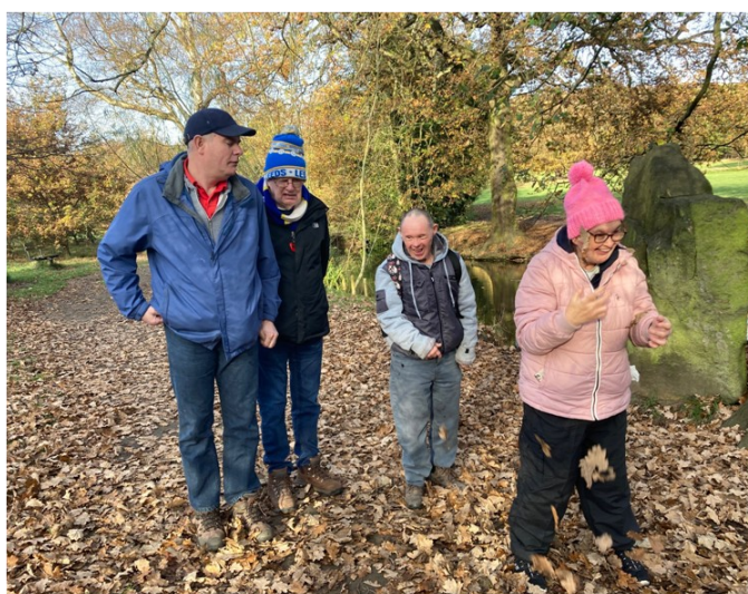
Our Wanderers having fun!

We pick people up in both Harrogate and Wetherby. Contact us if you are interested in joining in the fun.