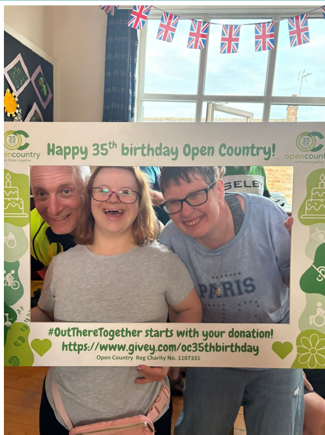
'35 Tandems' - a night to remember