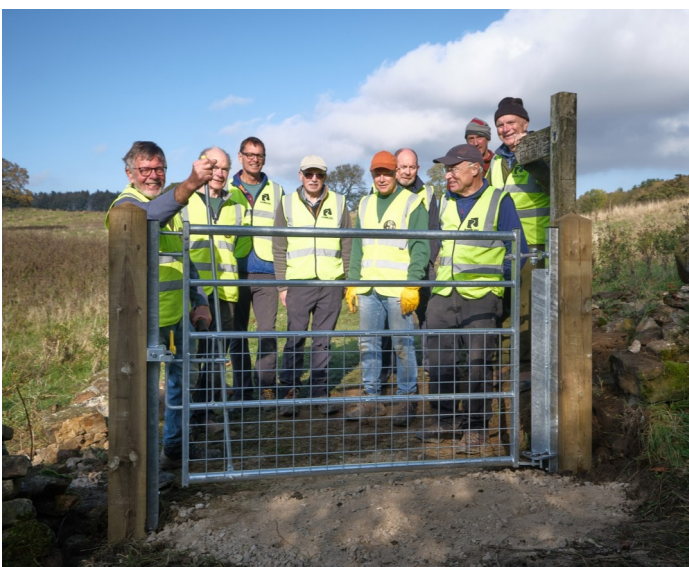
This gate used to be a stile!