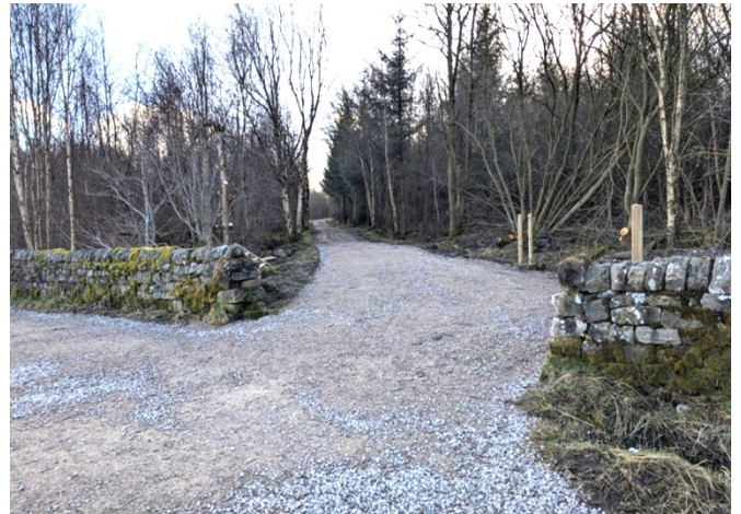
This gap used to be a gate!

That's the thing about many barriers at the end of the day - lots of them are just there because people haven't quite thought things through enough.