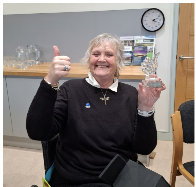
Well done also to Access the Dales!

A huge thank you to everyone who attended and to North Yorkshire Council's 'Inspire Fund' for sponsoring this event. Next year's Conference will be held at Burley-in-Wharfedale on Friday 13 th November 2026 .