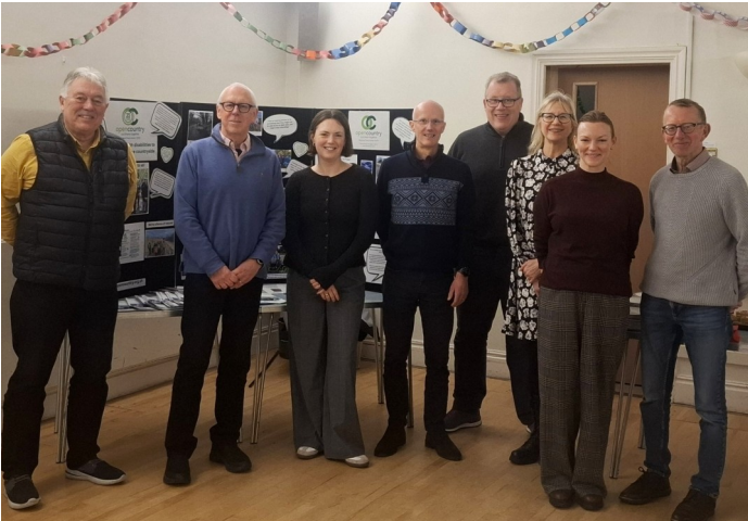
Our Board of Trustees at our recent AGM